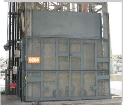
17,000 lb capacity Personnel/Freight Elevator

This tower is used as a test and observation platform for various United States Air Force missions located on the gulf coast. Continuous maintenance is required to satisfy mission ready status.