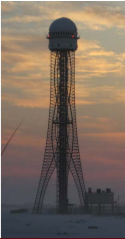
Tower with canopy closed